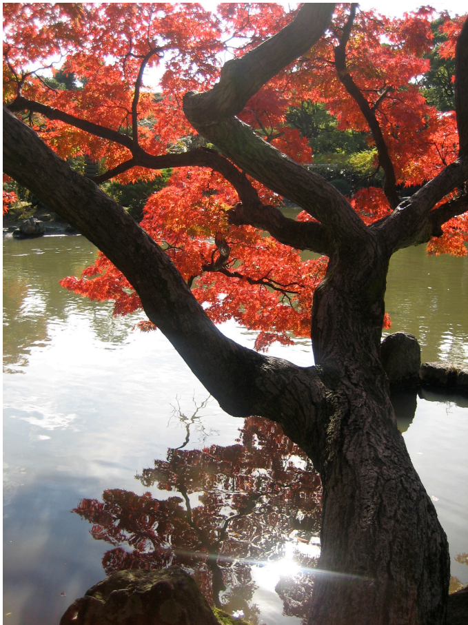
I took this photo in Tsurumai park last autumn. 2007